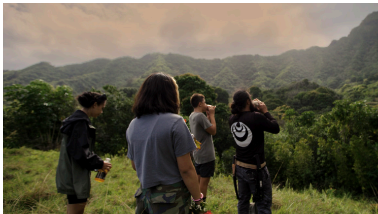
Lorem ipsum dolor sit amet, consectetur adipiscing.