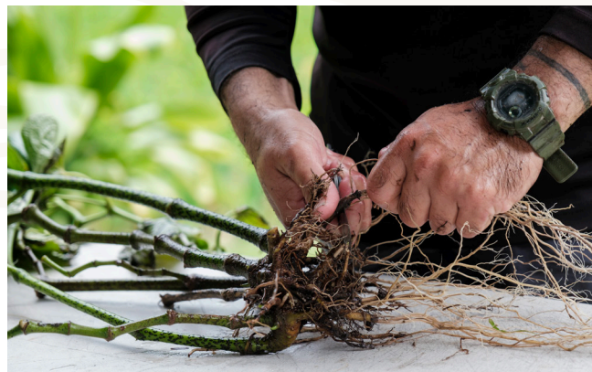
Kōlea Fukumitsu prepares awa (ceremonial root) for the ho'okupu (offering) during the filming.