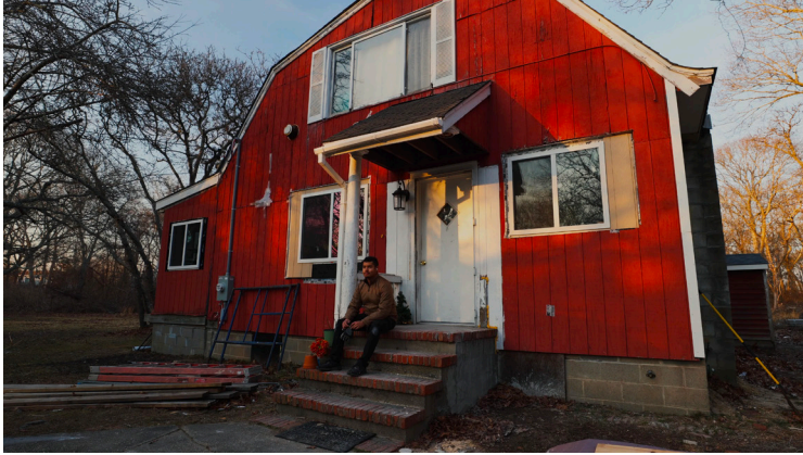
Ma's House in early spring.