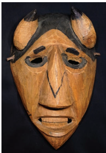
➤ Mask by Allen Long https://www.maskmuseum.org/mask/cherokee-bison/