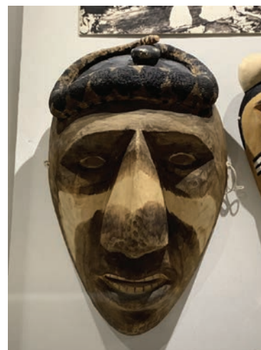
➤ Qualla Arts and Crafts. Snake mask by Allen Long https://quallaartsandcrafts.org