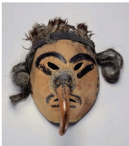
➤ Cherokee Booger Mask made out of gourd https://americanindian.si.edu/static/exhibitions/infinityofnations/woodlands/237839.html