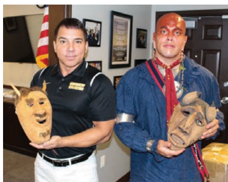
➤ Repatriated Cherokee Booger Masks entrusted to Museum https://theonefeather.com/2019/08/20/repatriated-cherokee-booger-masks-entrusted-to-museum/