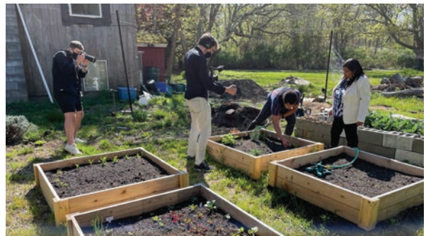
Behind the scenes while making the Reciprocity Project film about Ma's House.