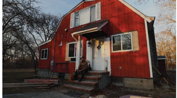
Ma's House in early spring.