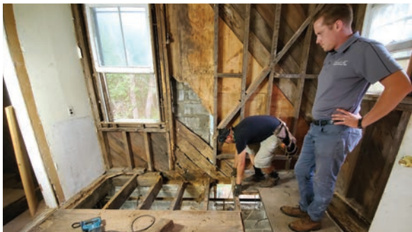
Behind the scenes construction with community.